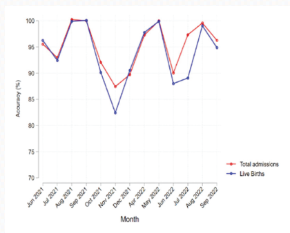
Figure 2: Accuracy of total admissions and live births.

Figure 1 shows that there was general overreporting of health facility ANC data in the DHIS2, although there was some underreporting in May 2022 for the first ANC visit. The total number of ANC visits seems to be the most overreported, especially in October 2021. Save for the 8th ANC visit, data for the 1st and 4th visit were almost in tandem for the health facility and HMIS data.